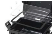
Waterproof panel kit