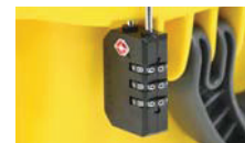
TSA approved padlock